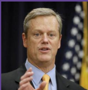
Charlie Baker State Governor "Scheduled"